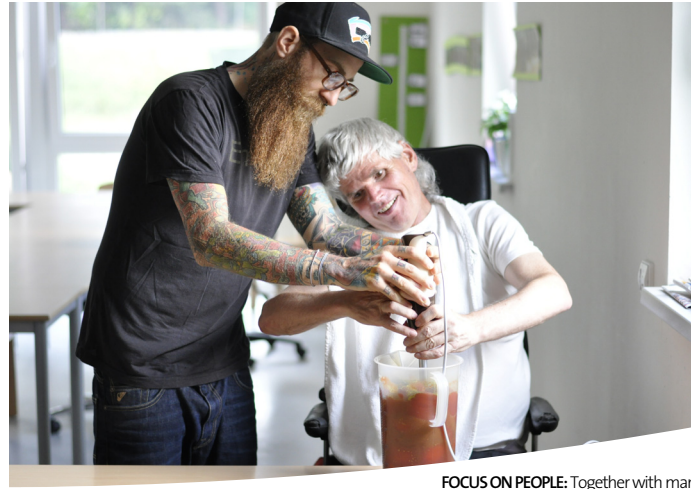
FOCUS ON PEOPLE: Together with many other institutions in all of Hesse, the LWV serves the needs of disabled people.